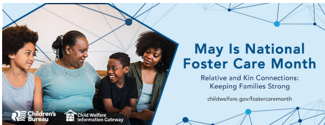
Facebook Cover Photo | Twitter Cover Photo